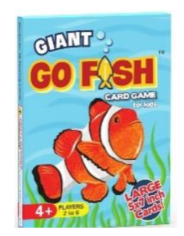
GIANT Go Fish ® Play a jumbo-sized version of GO FISH and OLD MAID with these 5x7 inch novelty cards. Ages 4 to Adult